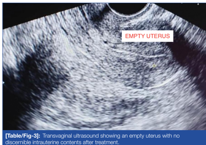
[Table/Fig-3]: Transvaginal ultrasound showing an empty uterus with no discernible intrauterine contents after treatment.

the caesarean scar. The commonest symptom is painless vaginal bleeding, that may be massive and the diagnosis depends upon transvaginal ultrasonography and colour doppler findings. In a study conducted by Lin Y et al., the patients of CSP were divided into three broad categories depending on the ultrasound findings [4].