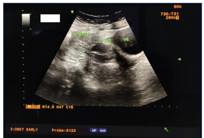
[Table/Fig-1]: Transvaginal ultrasound showing intrauterine Gestational Sac (G SAC) with foetus at the previous caesarean scar site posterior to Urinary Bladder (UB).

Caesarean scar pregnancy is a rare form of ectopic pregnancy where there is complete or partial implantation of the gestational sac, villi and placenta into the myometrium of a previous scar [1]. The incidence of CSP is approximately 1:2,000 of all pregnancies