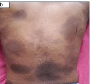
[Table/Fig-7]: a) Extensive erythematous scaly plaques at the back before the initiating secukinumab; b) Post inflammatory hyperpigmented patches in the same patient after completing 5 doses of secukinumab.