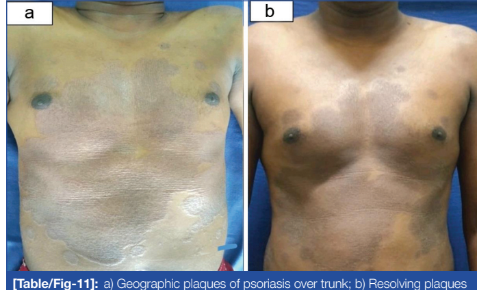
with minimal scaling and hyperpigmentation after treatment with secukinumab.

Various conventional therapeutic approaches are already in use for psoriasis. The invention of biologicals like TNF-alfa inhibitors (infliximab, adalimumab, etanercept), IL-17 inhibitors (secukinumab, ixekizumab, brodalumab) made the treatment of psoriasis revolutionary. Secukinumab (monoclonal antibody to IL-17A) is widely used in India for management of psoriasis and psoriatic arthritis [13]. Secukinumab was approved for use in psoriasis in 2015 in adults and in 2021 for children more than six years [14]. Efficacy is particularly notable in patients who do not respond to conventional treatments. We had several patients with previous treatment with methotrexate (50%), other biologicals like infliximab (3%) who did not show much response to these drugs. Since, IL-17 modulates the progression of secondary IgA nephropathy, use of secukinumab can protect against associated renal damage in chronic psoriasis patients. The drug has shown cardioprotective effects by increasing the Flow Mediated Dilation (FMD) which is a marker of endothelial function in