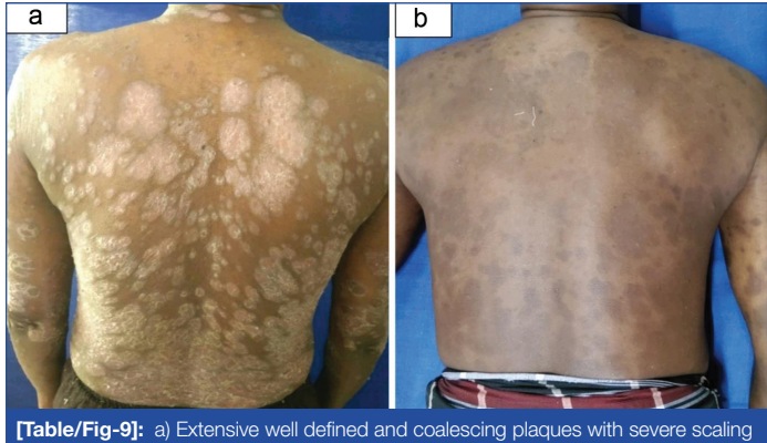
before secukinumab therapy; b) Complete clearance of plaques with residual pigmentation after secukinumab therapy.