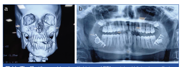
[Table/Fig-2]: 16-year-old male with history of RTA sustained bilateral mandibular angle fracture. a) 3D CT image showing bilateral angle fracture with displacement of right angle; b) Orthopantomogram after fixation with plates, intraoperative image showing left side plate post fixation with inter maxillary fixation, intraoperative image showing occlusion postfixation.

[Table/Fig-1]: A case of 45-year-old male, of RTA with face avulsion injury due to road traffic accident sustained multiple facial bone displaced and comminuted fractures. Right mandibular angle was a comminuted fracture with left body fracture. a) 3D CT image showing comminuted facial bone fracture (preoperative); b) 3D CT showing facial bone fixation with plates fixed by extraoral approach (postoperative).