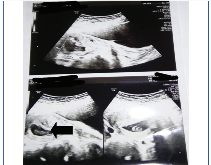
[Table/Fig-1]: Ultrasonography (USG) showing a small rent in the uterine wall with omental herniation inside the uterine cavity.

The patient and attendants were explained about the condition and were advised a laparotomy to manage the case with the consent of hysterectomy, if required. After obtaining informed consent, a laparotomy was performed under subarachnoid block in view of the stable hemodynamics of the patient and having no contraindication of spinal anaesthesia. The intraoperative findings