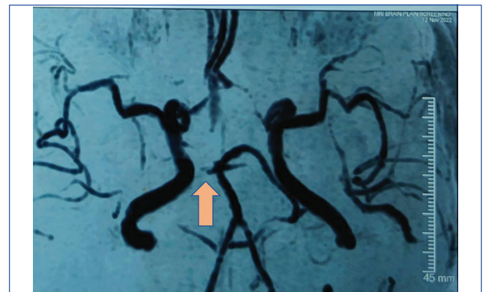
[Table/Fig-2]: MR Angiograph- Arrow showing absence of flow in right posterior cerebral artery.

therapy was given after two weeks during follow-up as the main stay of treatment and the patient was discharged once stable. The platelets improved to the normal limits. During the follow-up visit she