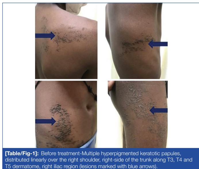
[Table/Fig-1]: Before treatment—Multiple hyperpigmented keratotic papules, distributed linearly over the right shoulder, right-side of the trunk along T3, T4 and T5 dermatome, right iliac region (lesions marked with blue arrows).

On cutaneous examination, multiple hyperpigmented keratotic papules were distributed linearly over the right thigh, abdomen, chest, upper back, and right shoulder [Table/Fig-1]. The scalp, nails, and mucous membranes were normal.