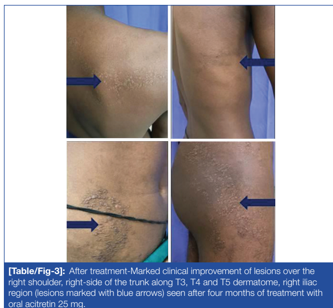
[Table/Fig-3]: After treatment—Marked clinical improvement of lesions over the right shoulder, right-side of the trunk along T3, T4 and T5 dermatome, right iliac region (lesions marked with blue arrows) seen after four months of treatment with oral acitretin 25 mg.