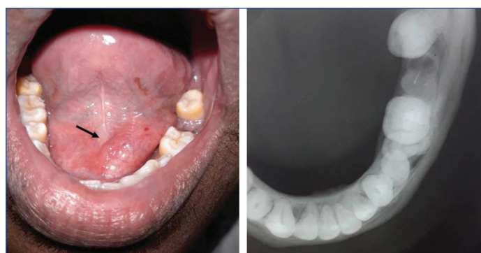
[Table/Fig-2]: A dome-shaped swelling in the left floor of the mouth.