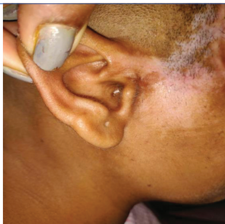
[Table/Fig-1]: Post-traumatic right ear showing External Auditory Canal (EAC) atresia.

On examination, a 10×1 cm scar was present extending from right parietal region till right zygomatic arch with tenderness over the scar [Table/Fig-1]. Tenderness was also present over right preauricular and postauricular region. Stenosis was present in the right external auditory meatus hiding the visibility of the tympanic membrane. There was tenderness over the stenosed area. Facial nerve examination showed loss of wrinkling on the right side with slight deviation of the angle of mouth to left side.