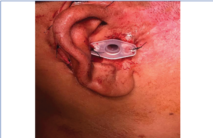
[Table/Fig-3]: Immediate postoperative image of right ear showing stent placed upto bony-cartilagenous junction of External Auditory Canal (EAC).

was noted in anterosuperior quadrant of tympanic membrane. Bony part of EAC widened using diamond burr. The postaural incision was extended superiorly, temporalis fascia was harvested. The perforation was sealed by overlay technique using temporalis fascia. Gel foam placed in bony part of EAC. A stent was kept by using a 1cc syringe which was cut into half and placed up to bony cartilagenous junction of EAC and gel foam was placed surrounding it. Postauricular incision was sutured and stay sutures applied to stent [Table/Fig-3] and mastoid dressing done. Complete haemostasis was maintained throughout the procedure. Patient was extubated and shifted to postoperative care unit under stable condition.