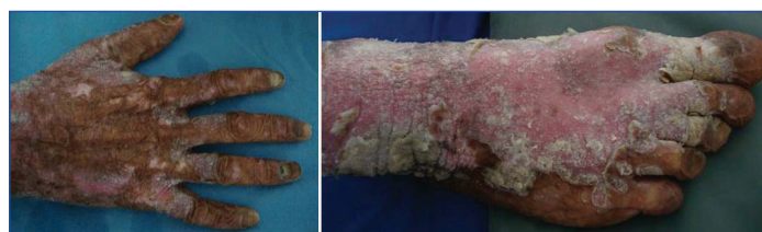
[Table/Fig-3,4]: Dystrophic nails and anonychia with atrophic scars. (Images from left to right)

The erythroderma was initially treated with isotretinoin, presuming the cause to be EBD but had to be discontinued as the patient developed visual and auditory hallucinations. He had extensive exfoliation associated with burning sensation. Meanwhile, his mother who was attending to him was diagnosed with scabies and treated