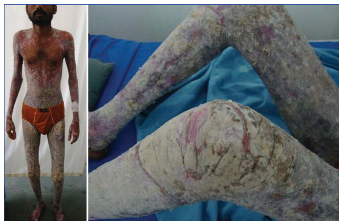
[Table/Fig-1,2]: Showing hyperkeratotic extensive scaling with accentuation over extremities. (Images from left to right)

for the same. With a high index of suspicion, a scraping for KOH mount was done from the patient which showed numerous scabies mites, eggs and faecal pellets [Table/Fig-5]. HIV I and II ELISA were negative. A final diagnosis of erythroderma secondary to crusted scabies was made.