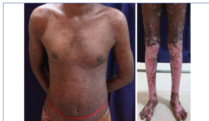
[Table/Fig-6,7]: Complete resolution at six weeks. (Images from left to right)

The patient was started on weekly oral Ivermectin (200 mcg/kg) and topical 5% permethrin applications. There was dramatic response within 1-2 weeks. Weekly topical 5% permethrin applications were continued for a total of six weeks. At six weeks patient had complete resolution of erythroderma, however only few bullae over the legs reminiscent of his EBD were present [Table/Fig-6,7].