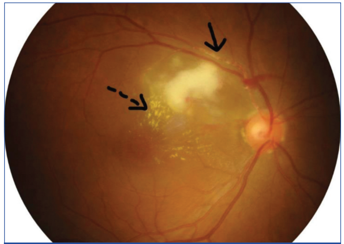
[Table/Fig-1a]: Fundus photograph of right eye of a patient showing active retinitis. Black arrow shows vascular exudation. Broken arrow showing macular fan.

A total of 13 patients, underlying aetiology could be determined in only 5 (38.46%) patients. Two had a positive Weil-Felix test at the time of fever episode, one had a positive Widal test and two patients were positive for IgM chikungunya virus. Two patients had been suspected to have rickettsial infection at the time of the febrile episode but were Weil-Felix test negative, and had been treated with oral doxycycline (tab DOXT-SL, Dr. Reddy's Laboratories Ltd.,) for two weeks by the physician. Immune Fluorescence Assay