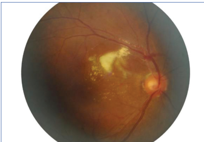
[Table/Fig-1c]: Fundus photograph of right eye of patient (shown in [Table/Fig-1a]) after initiation of oral corticosteroid therapy.