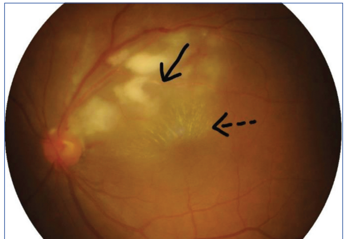
[Table/Fig-1b]: Fundus photograph of left eye showing active multifocal retinitis in the posterior pole. Black arrow shows vascular exudation. Broken arrow showing macular fan.