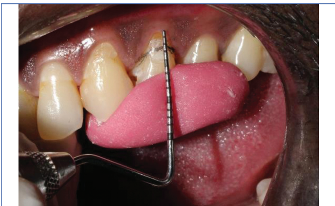
[Table/Fig-4]: Control Group: Millers Class-I recession irt 24.