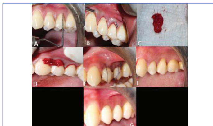
[Table/Fig-1]: a) Preoperative photograph showing 3 mm of recession depth with cervical abrasion restored with GIC. b) Tunneling done using Tunneling knife 1 and 2. c) Connective Tissue Graft harvested d) Graft placed into the prepared tunnel e) Horizontal mattress sutures placed with vicryl 5-0 sutures and stabilised using composite. f) Suture removal done after 10 days. g) Complete coverage of recession seen after six months of follow-up.

repositioning of the gingiva. Furthermore, using a papillae elevator and tunnelling knife 2, the tunnel was extended interproximally under each papilla as far as the embrasure space allowed, without making any surface incisions into the papillae. After giving local anaesthetic, the palatal donor site was checked for 3 mm thickness using a periodontal probe. Two parallel incisions were created using a 15-number blade in the region between the first molar and the canine, and vertical incisions were made at the mesial and distal ends of the majority of exterior incisions. In order to retract the SCTG graft, 4-0 silk sutures were placed into the palatal tissue [10,11]. Sutures were used to close the palate wound in the vertical incisions, as well as, the suture used to retract palatal tissue for access. Graft was cut to the precise measurements of the operating room. A fine-tipped, curved, serrated forceps was used to insert the membrane and stabilise in the subperiosteal tunnel. A horizontal mattress suture using a 5-0 polypropylene suture and a C3 needle was then placed at roughly 2 to 3 mm apical to the gingival margin of each tooth, covering the breadth of the tooth, to maintain the membrane and mucogingival complex in its new location [Table/Fig-1-5].