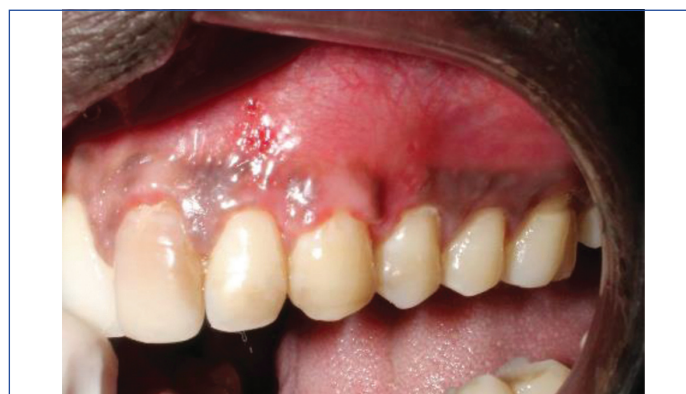
[Table/Fig-3]: Six months postoperative test group.