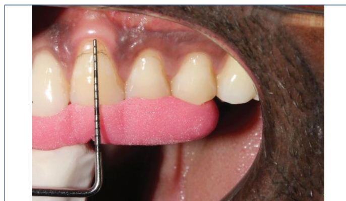
[Table/Fig-2]: Test Group: Millers Class-I recession in 23.