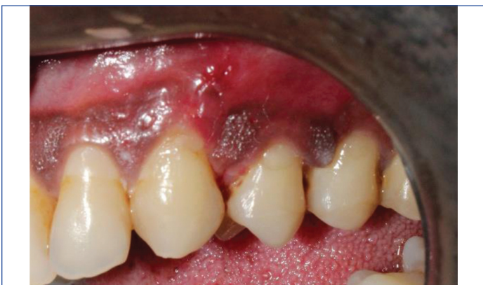
[Table/Fig-5]: Six months postoperative control group.