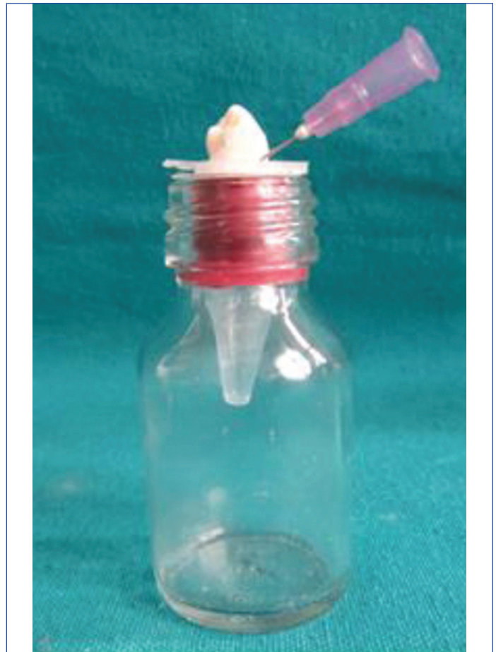
[Table/Fig-1]: Apparatus used to collect debris and irrigant during endodontic preparation.

Eppendorf Tubes were preweighed using the analytical balance (Sartorius-Germany) with an accuracy of 10^{-4} . The Eppendorf tubes' stoppers were created with an opening, and the teeth were put through the orifice until the Cemento-enamel Junction (CEJ) was 1-2 mm above the stopper. A rubber-dam sheet was used to check seepage of overflowing irrigant during irrigation and this assembly was fitted onto a glass vial [Table/Fig-1,2].