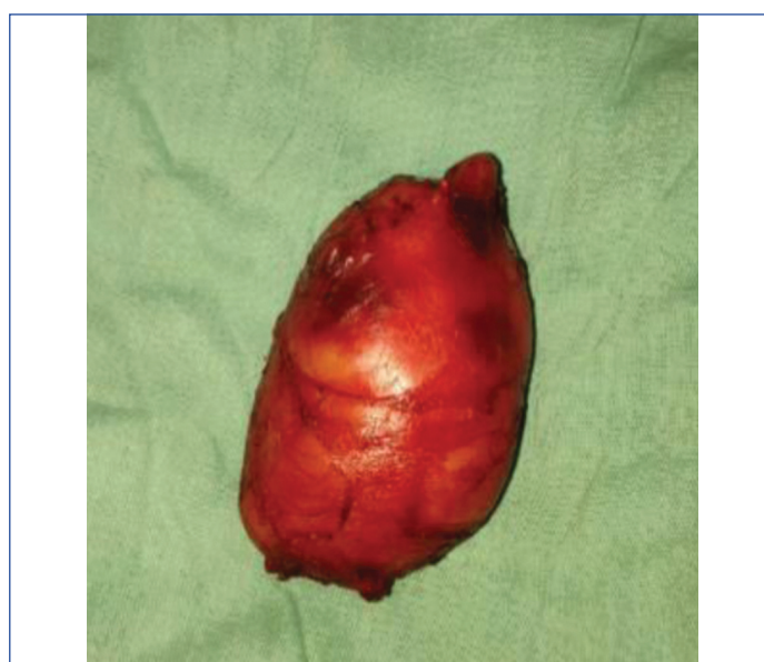
[Table/Fig-2]: The surgical specimen, measuring 6×4 cm.

Surgical excision of the lipoma was performed under general anaesthesia. The excised specimen was rubbery and lobulated, with a maximum anteroposterior diameter of 6×4 cm [Table/Fig-2]. The mass was well separated from the surrounding tissues and had a fatty-yellow appearance with a well-defined capsule. Histological examination confirmed the presence of clear lobules of mature fat cells, consistent with the diagnosis of a classic lipoma [Table/Fig-3].