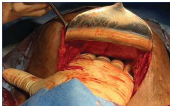
[Table/Fig-2]: Doyen's retractor is used to retract the anterior abdominal wall, for better visualisation and palpation of lateral border of rectus muscles.

to the lateral border of the rectus muscle. This was necessary to avoid injury to the inferior epigastric vessels. The needle was gently advanced until there was an appreciable loss of resistance (one 'pop'), indicating piercing of the transversus muscle fascia. After careful aspiration to ensure that no vascular injury had occurred, 20 mL 0.25% bupivacaine with 4 mg of dexamethasone was injected slowly without any undue resistance [Table/Fig-3]. A similar procedure was repeated on the opposite side, and then the surgeon proceeded to close the abdomen. The time of the end of surgery was noted when the last skin suture was secured. Patients in both groups received a diclofenac 100 mg rectal suppository before shifting to the postoperative ward.