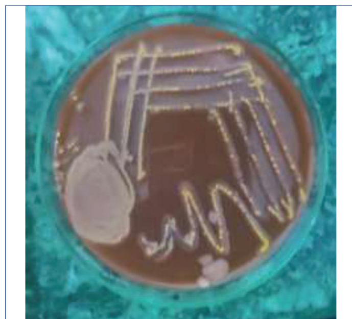
[Table/Fig-3]: Showing bacterial colonies of Group I.