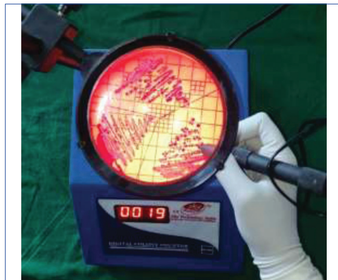
[Table/Fig-2]: Showing counting bacterial colonies on the digital colony counter.

Laboratory procedures: The pre- and postirrigation samples were streaked out on petri plates and placed in an anaerobic gas jar for 48 hours. Once bacterial growth was observed, the magenta-pink-coloured colonies were inoculated on a slide, and gram staining was performed. The bacterial colony forming units were counted in the inoculated samples under a microscope using the turbidimetry method and McFarland's scale pattern. This method calculates the number of bacteria in suspension (as CFU/mL) by comparing the different values of turbidity or density on the scale [Table/Fig-2-4] [6].