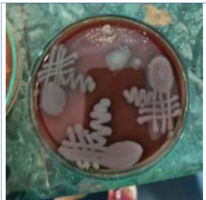
[Table/Fig-4]: Showing bacterial colonies of Group.