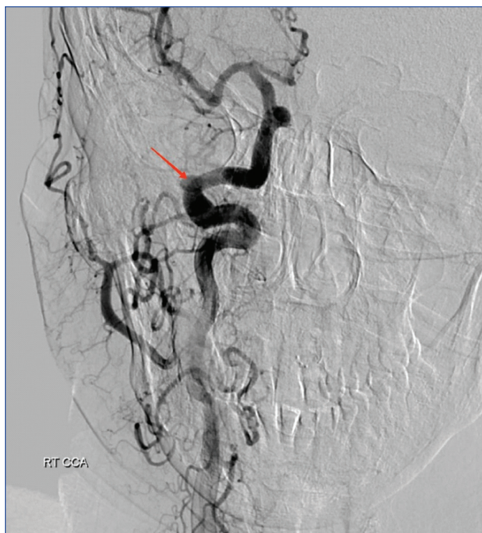
[Table/Fig-3]: Digital Subtraction Angiography (DSA) showing an irregular aneurysm arising from the right petrous of internal carotid artery (arrow).

the BTO, indicating the absence of cross-circulation across the circle of Willis. The patient was subsequently referred to the Neurosurgery Department for high-flow bypass surgery, involving the connection between the external carotid artery and the M2 segment of the MCA using a radial artery graft. Postoperatively, the patient recovered well, and there were no further episodes of ear bleeding during her last follow-up six months after the above-mentioned surgery.