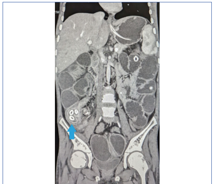
[Table/Fig-1]: Computed Tomography (CT) scan showing radiopaque material in right iliac fossa (blue arrow).