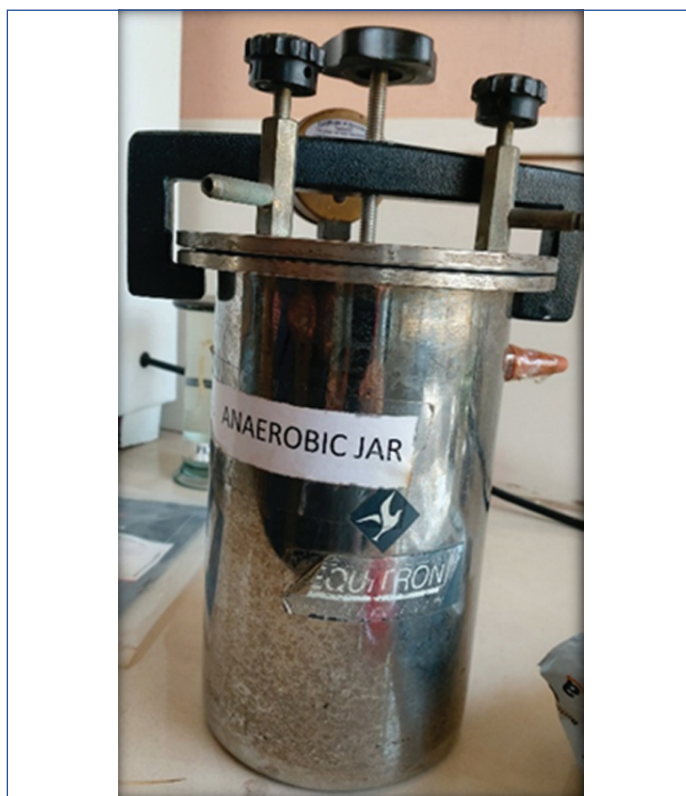
[Table/Fig-5]: Anaerobic gas jar.

In the second part of the study, the S. mutans strain (ATCC no. 25175) was obtained from the Microbiology lab of MGM Medical College and Hospital, cultured, and incubated in an anaerobic gas jar at 37°C for 48 hours, as shown in [Table/Fig-5] [1,9].