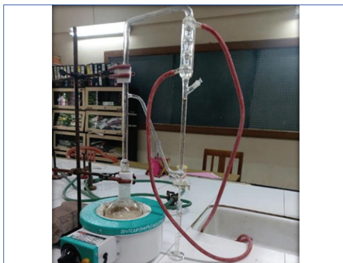
[Table/Fig-3]: Steam distillation.