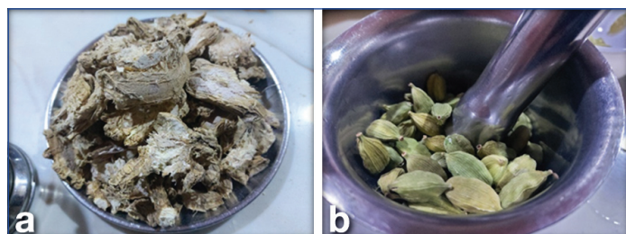
[Table/Fig-1]: a) Dried form of ginger; b) Cardamom.

Conduction of the study: The study was conducted in two parts: the first part involved extracting oils from garlic ( Allium sativum ), ginger ( Zingiber officinale ), and cardamom ( Elettaria cardamomum ) using a steam distillator in the Pharmacy College, while the second part included screening the antimicrobial activity of these oils against S. mutans using the disc diffusion test in the Department of Microbiology. The dried form of ginger and cardamom, and ground form of garlic, were obtained from a registered herbal shop (S.V. Ayurvedic Bhandar) as depicted in [Table/Fig-1]. Ginger and cardamom were ground into coarse particle sizes as shown in [Table/Fig-2]. Among various oil extraction methods, steam distillation was chosen as it is one of the best methods to obtain the pure form of oil, including their active ingredients [8]. Approximately, 10 mL of oil was extracted from each of the mentioned herbs using a steam distillator. The entire oil extraction process took around six days, with each oil being extracted over two days, as illustrated in [Table/Fig-3,4].