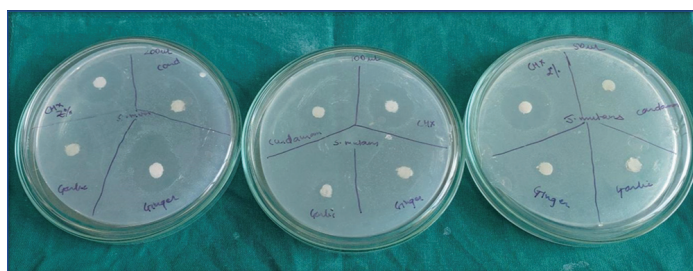
[Table/Fig-7]: Zone of inhibition measured on Muller- Hinton agar plates for 200 µL, 100 µL and 50 µL concentration, respectively (From left to right).