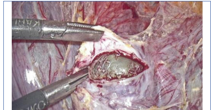
[Table/Fig-3]: Gestational sac in caesarean scar pregnancy.

The CSEP is by far the most common sequelae of scar defects. Over this period, six patients were referred to the present study Institute as diagnosed cases of scar pregnancy [Table/Fig-3]. On TVS evaluation, they exhibited myometrial reduction of over 50% (RMT <3 mm). They were managed laparoscopically with excision of the scar pregnancy followed by double-layered closure. Round ligament plication was performed to correct retroversion in two of these cases [11]. One patient had heterotrophic bilateral tubal ectopic pregnancy along with CSEP, for which bilateral salpingectomy was performed alongside laparoscopic excision of CSEP.