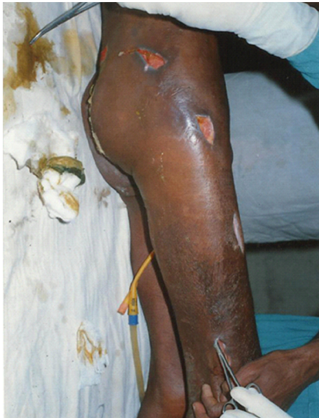
[Table/Fig-2]: Thigh and gluteal abscess was drained by multiple incisions