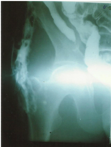
[Table/Fig-3]: Barium enema showing leakage of contrast material; descending into the right thigh.

caused by diverticular disease or perforated rectal cancer [1, 2, 6]. An overall finding is that gas which is confined to the leg, usually has its origin in the lower intestine.