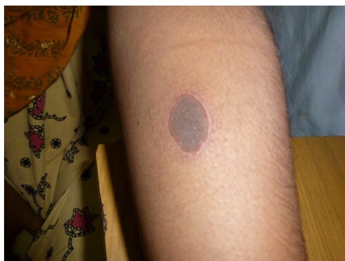
[Table/Fig-8]: Cutaneous allergy due to Lignocaine test dose

were observed in our study, were probably due to the increased incidence of the diabetes and the altered immunological status of the diabetic patients [10].