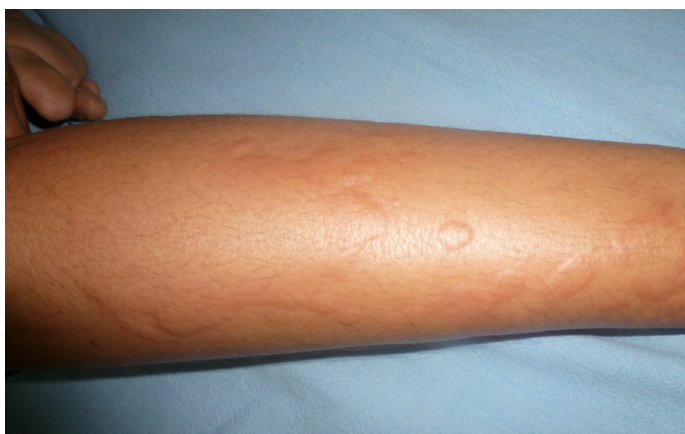
[Table/Fig-5]: Acute Urticaria due to NSAIDs