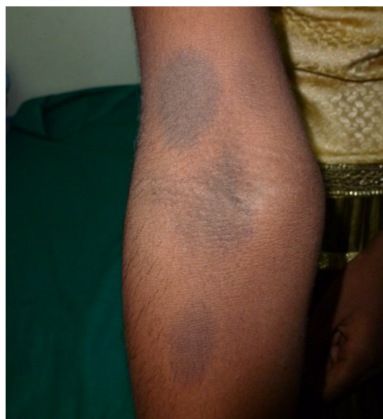
[Table/Fig-7]: Fixed drug eruption due to Quinolones

A history of a previous systemic illness was present in 40.5% of the patients, among which it was diabetes in 15.3% cases, bronchial asthma in 8.8% cases, hypertension and diabetes in 3.45% cases and epilepsy in 1.7% of the patients. The increased incidences of the cutaneous adverse drug reactions in the diabetic patients which