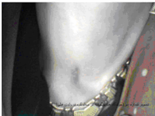
Table/Fig 2: Hyperpigmented scar at the previous nodule site.