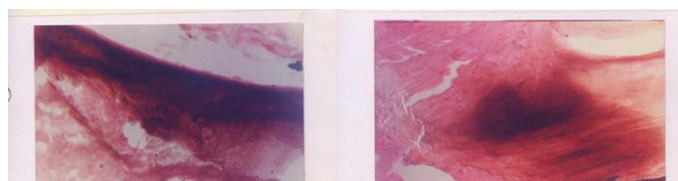
[Table/Fig-3]: Section of callus: High alkaline phosphatase activity in experimental animals. (50X) compared to control