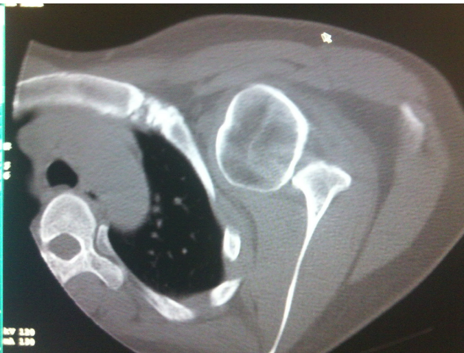
[Table/Fig-3]: Axial image with bone window reveals anterior dislocation of humeral head