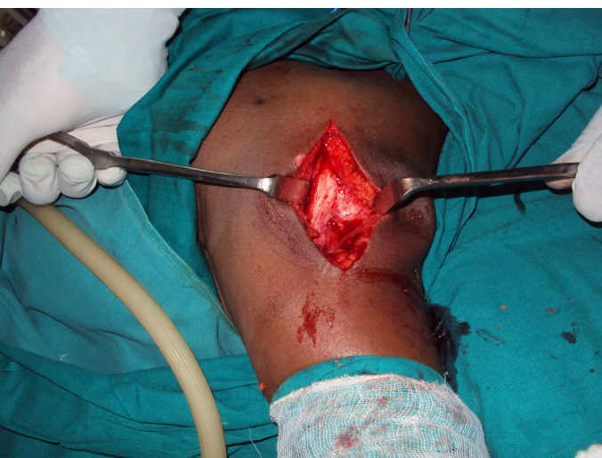
[Table/Fig-5]: Intra operative photograph showing the white glistening fibrous band

thick fibrous band [Table/Fig-5]. The fibrous band was released from its insertion by using diathermy. The shoulder was held in the adducted position, the remaining fibrous strands were released and the deformity was corrected. The excised fibrosed deltoid muscle was subjected to a histopathological examination. The wound was closed and the limb was suspended in an arm sling. Gentle active and passive exercises were commenced from the second post-operative day.