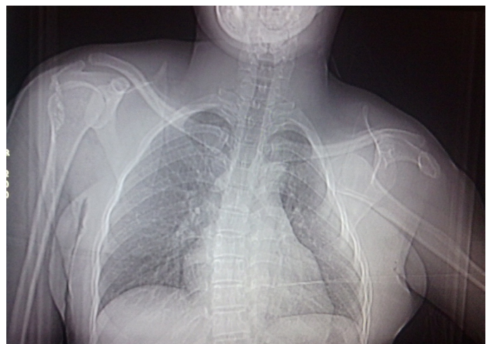
[Table/Fig-2]: X ray showing anterior dislocation of the Left shoulder