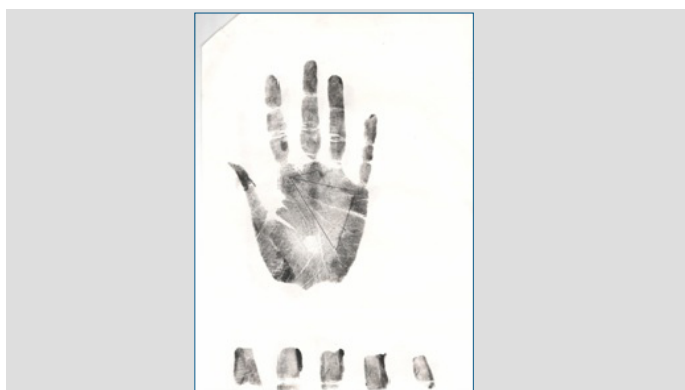
[Table/Fig-1]: Finger prints and palm prints of a control taken during study.

The materials which were required were: Camel quick drying duplicating ink, a rubber roller, an inking slab (a thick glass sheet which was fixed on a wooden support), an A4 size white sheet, a pressure pad which was made of rubber foam, cotton puffs, a