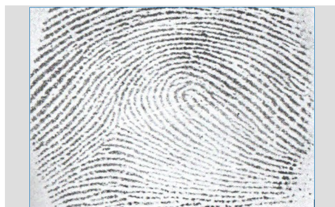
[Table/Fig-3]: A loop with a count of eleven ridges. Ridges are counted along the indicated line which Point of Triradius (outer terminus) and point of core (inner terminus).

The finger tip ridge pattern was compared between the cancer patients and the controls by using the Z-test. For the Z-test, whenever the calculated Z value was below 1.96, the difference in the proportions was considered as non-significant.