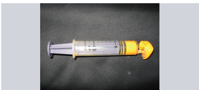
[Table/Fig-2]: Impression of ocular defect