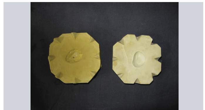
[Table/Fig-3]: Split Cast mold

An 80 year old male patient reported to the Department of Prosthodontics, P.M.N.M Dental College, Bagalkot, Karnataka, India, for the prosthetic replacement of a missing right eye. His history revealed that his right eye was enucleated 2 years ago, following an infection, pain and discomfort after he underwent a cataract operation in a local village medical camp [Table/Fig-1]. On general examination, it was noticed that the conjunctiva which covered the posterior wall of the anophthalmic socket was healthy and that it elicited synchronous movements. There was adequate depth between the upper and lower fornices for the retention of the ocular