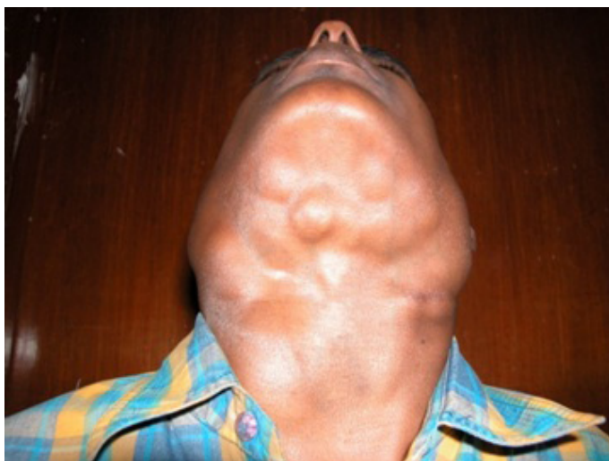
[Table/Fig-1]: Patient with massive cervical lymphadenopathy

He was moderately built and anaemic. All the other family members were clinically normal. Intra oral findings showed that the periodontium and the dentition was normal. His Laboratory tests revealed normochromic and normocytic anaemia. There was no increase in ESR, leukocytosis, or hypergammaglobulinaemia.