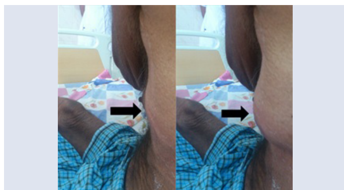
[Table/Fig-1]: Serial photographs demonstrating an expansile swelling with expiratory and inspiratory movements in left infra axillary area(marked with black arrows)

ing. [Table/Fig-2]. Anti-tubercular therapy was continued and a fresh ICD was inserted at the lower intercostal space, which drained the purulent fluid. After a week, repair and layered suturing was done at the site of dehiscence. The wounds approximated and healed over the next 3 – 4 weeks. A pyo-pneumothorax which is caused by tuberculosis is common in endemic areas [1]. There is one report in the literature on herniation of an emphysematous bulla through an ICD site [2]. However, herniation of a pyo-pneumothorax through a closed ICD site was not found in our literature review.