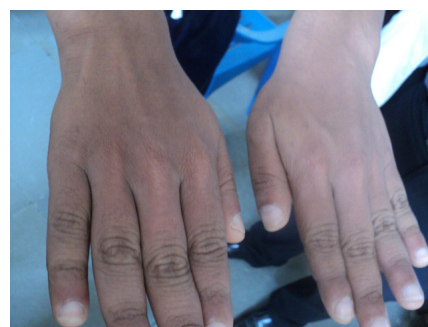
[Table/Fig-2]: Clubbing of fingers