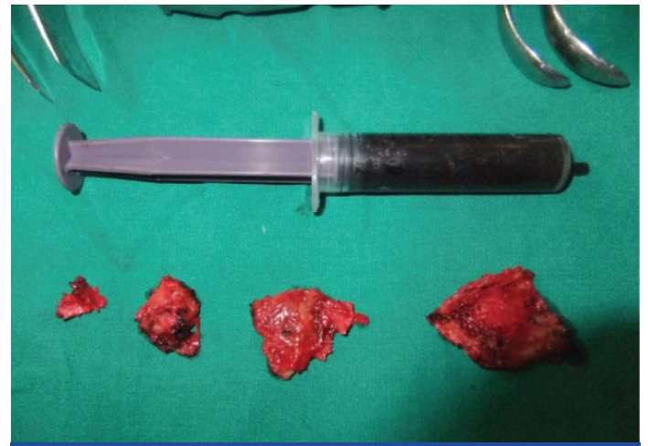
[Table/Fig-6]: Tissues excised out of the lesion their approx sizes and fluid aspirated out of the lesion

The method of treatment of an aneurysmal bone cyst of the pelvis must be individualized, depending on the location, aggressiveness and extent of the lesion. The treatment options include complete resection of the lesion, simple curettage, curettage and bone grafting, selective arterial embolization (primary treatment or preoperative adjuvant therapy) and a percutaneous injection of a fibrosing agent. Yildirim et al., [14] reported their experiences with aneurysmal bone cysts of the adult pelvis. Lesions which are less than 5 cm, that exhibit minimal destruction or expansion of cortical bone and don't threaten the integrity of acetabulum or the sacroiliac joint, are best treated with intra-lesional curettage, with or without the use of bone grafts. Lesions which are greater than 5 cm, which exhibit large areas of destruction or major expansion of the cortical bone and which threaten the integrity of the acetabulum or the sacroiliac joint