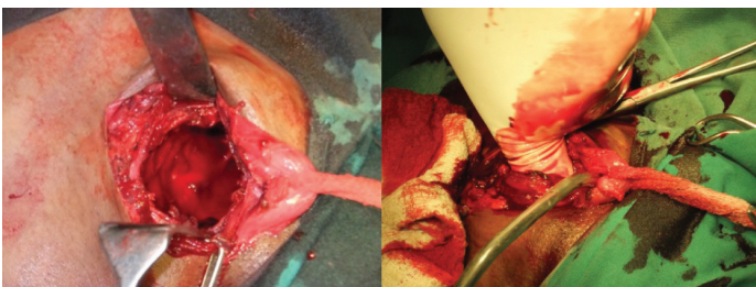
[Table/Fig-5]: Picture showing the cavity in the bone

gauze in-situ, so that there was a way out for the drainage of the intra-lesional collection of the blood. Routine dressings were done by keeping the ribbon gauze in the lesion and it was left in position until the next dressing. Intra-lesional rubber catheter was removed after five days and sutures were removed after 13 days. There were no complications in the post operative period, except for scrotal oedema which had occurred due to the handling of the spermatic cord, which required pressure dressings for it to subside.