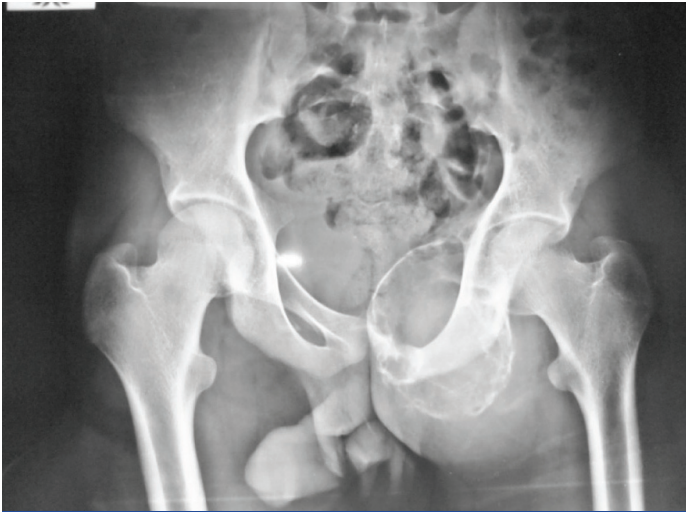
[Table/Fig-2]: X-ray Pelvis Ap view showing the lesion