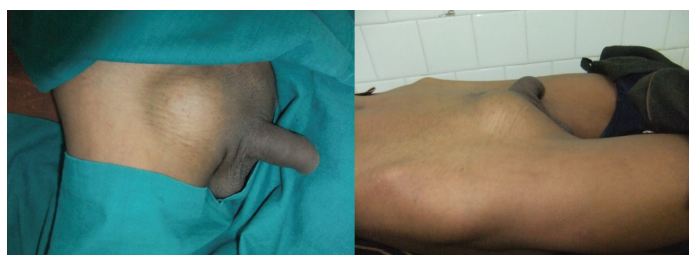
[Table/Fig-1]: Clinical Photograph of the picture

At operation, the mass was exposed extra-peritonally through a right supra-inguinal incision. The spermatic cord was isolated from the tumour mass and it was retracted and held separately, being secured from the surgical field. After the dissection, the protruding portion of the tumour was exposed. A 20cc syringe was taken and the lesion was punctured and aspirated. About 80cc of haematogenous fluid was removed from the anterior and inferior portions of the lesion and the posterior and superior portions of the lesion were palpated. They were found to be in close proximity to the intra-abdominal structures and their removal was not attempted, considering the risk. Bleeding from the cavity which had resulted from the curettage, could only be partially controlled by packing it with ribbon gauze. The spermatic cord was placed back and the wound was closed directly with 2-0 ethylon for skin with simple sutures, keeping the ribbon