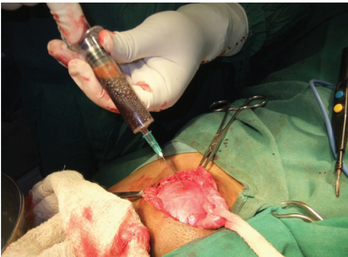
[Table/Fig-4]: Intra-operative photograph showing aspiration of the haematogenous fluid from the swelling