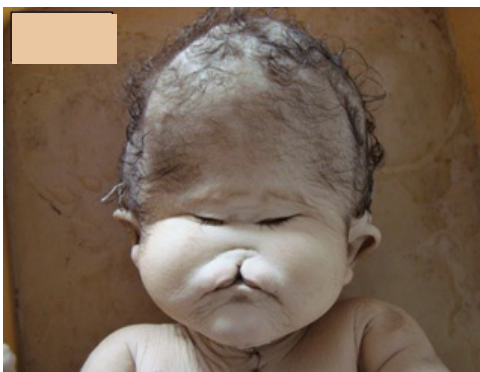
[Table/Fig-2]: Arrhinia, absence of nostrils, hypotelorism of eyes, central hair lip