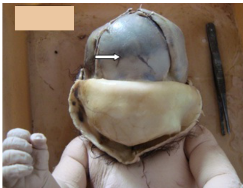
[Table/Fig-4]: Single hypoplastic Frontal Bone with absence of metopic sutures