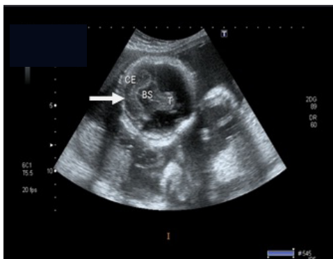
[Table/Fig-1]: Ultra sound of foetus at 28 week of gestation monoventricle with no obvious neural tissue