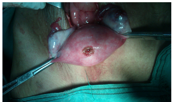
[Table/Fig-2]: Per Operative