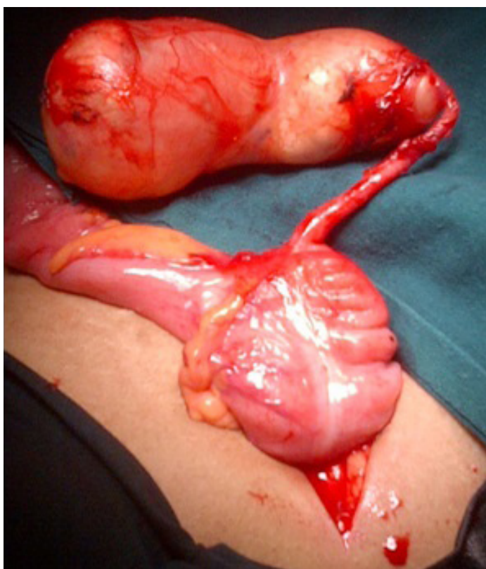
[Table/Fig-1]: Intra-operative image of mucocele at the tip of appendix

paracaecal region, adherent to caecum and ascending colon. With the probability of either hydatid cyst or mucocele of appendix as per CT abdomen, to avoid inadvertent injury and spillage of the mass, we decided to convert to open procedure. On laparotomy, after careful dissection, we found a well circumscribed mass, measuring 11x8 cm, arising from only the tip of appendix. Surprisingly, proximal 8 cm from the lesion till the base of the appendix looked absolutely normal. There was no evidence of mesenteric lymphadenopathy or free fluid. Open Appendectomy without rupturing the wall of appendix was done. Histopathological examination of the specimen revealed benign mucocele confined to the tip of appendix, without any evidence of obstruction or malignancy in the proximal part. The patient was followed up regularly for one year without any untoward findings [Table/Fig-1 and 2].