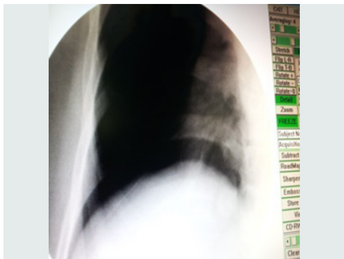
[Table/Fig-3]: Left pneumothorax

A 55- year- old lady was admitted to the hospital with left- sided renal stones. Anaesthetic assessment was obtained under ASA I and she was posted for PCNL. After the administration of general anaesthesia, the patient was turned to prone position for surgery. Intraoperative haemodynamics was stable and no complication was noted. She was reversed and extubated on table. After extubation, her oxygen saturation dropped down to 90%, and respiratory rate increased to 30 per minute. A hyperresonant note was heard on percussion of the left chest. There was decreased air entry on the left side on auscultation. She was diagnosed with left pneumothorax. This was confirmed by using C- arm and fluoroscopy [Table/Fig-3]. A chest tube was immediately inserted. Oxygen saturation picked up to 99% and the respiratory rate decreased to 22 per minute. She was shifted to ICU and observed for 24 hours. She recovered with no further complications, and was discharged after removal of chest tube on the 3 rd day.