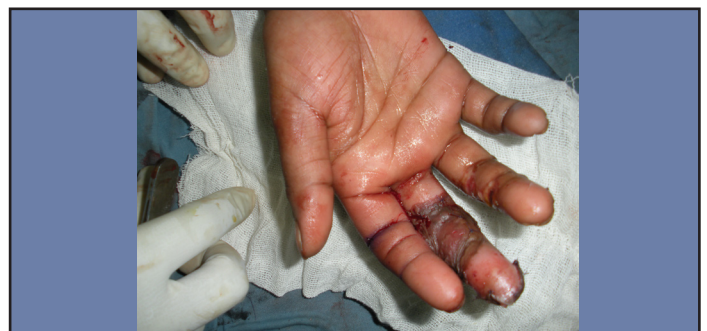
[Table/Fig-3]: Per-operative picture after covering the recipient site with adipofascial flap and skin graft

These patients were given crepe bandage compression and were advised for regular massage over the donor finger and recipient fingers for six months. Regular follow-up was done for 6 months.