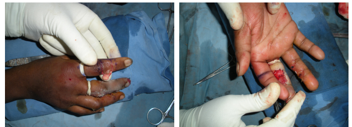
[Table/Fig-1]: Per-operative photo, Adipofascial flap from the index finger was raised like a page of a book and skin over the dorsum raised like a page of the book. Both of them are based on opposite sides

The surgery was performed under wrist block/digital block. Tourniquet was used and the procedure done with loupe magnification. The critical area of the defect was marked. The donor fingers were selected by planning in reverse and considering that finger which would be most comfortable for the patient in the post-operative immobilisation state. Those adjacent fingers which were comfortable, but, injured, were not considered as a donor finger. The skin (epidermis and dermis) were raised, like a page of the book with the base being on the contralateral side of the recipient finger. The skin was elevated, without transgressing the neuro-vascular line of the digits. The adipofascial flap, included the dorsal veins, fat and fascia was raised like a page of a book, with the base on the Ipsilateral side [Table/Fig-1,2]. The flap [Table/Fig-3] was inset to the defect and Split thickness skin graft that was minimally hand meshed was covered over the flap. The Skin graft was harvested from the medical side of arm in all our patients. The fingers were immobilised for 3 weeks. After 3 weeks, flap was divided and fingers mobilized slowly. Adequate physiotherapy was given after the wound healed.