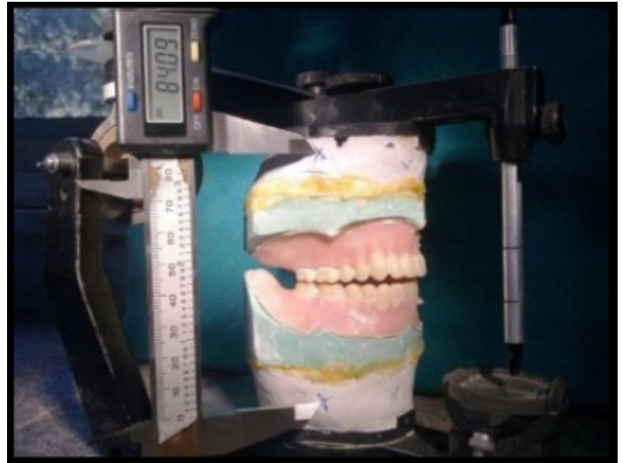
[Table/Fig-3]: Distance between posterior markings after processing

used for packing the denture was DPI Heat Cure (Bombay Burmah Trading Corporation, Ltd) and flask used was of Jabbar comp. size no.8, curing cycle was standardized by allowing the flask for bench curing for 45 minutes, followed by immersing the flask in cold water, then gradually boiling not less than 30 minutes. Total time for curing the denture was 1 hour. After the denture processed and before insertion the dentures were subjected to laboratory remounting (i.e. the dentures were placed on the articulator on their original plaster mountings using the key (index) in the base of the cast [Table/Fig-2] and the distance was measured again from markings previously made before processing both anteriorly (point A) and posteriorly (point B) [Table/Fig-3]. The readings obtained before and after processing were compared for all 30 subjects and evaluated [Table/Fig-4]. It was noted that there was a distinct variation in the vertical dimension following processing of complete dentures.