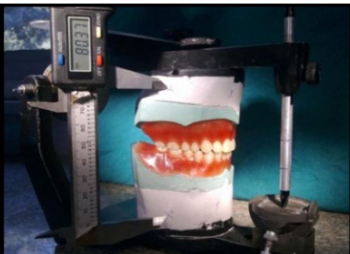
[Table/Fig-2]: Distance between posterior markings before processing

used for packing the denture was DPI Heat Cure (Bombay Burmah Trading Corporation, Ltd) and flask used was of Jabbar comp. size no.8, curing cycle was standardized by allowing the flask for bench curing for 45 minutes, followed by immersing the flask in cold water, then gradually boiling not less than 30 minutes. Total time for curing the denture was 1 hour. After the denture processed and before insertion the dentures were subjected to laboratory remounting (i.e. the dentures were placed on the articulator on their original plaster mountings using the key (index) in the base of the cast [Table/Fig-2] and the distance was measured again from markings previously made before processing both anteriorly (point A) and posteriorly (point B) [Table/Fig-3]. The readings obtained before and after processing were compared for all 30 subjects and evaluated [Table/Fig-4]. It was noted that there was a distinct variation in the vertical dimension following processing of complete dentures.