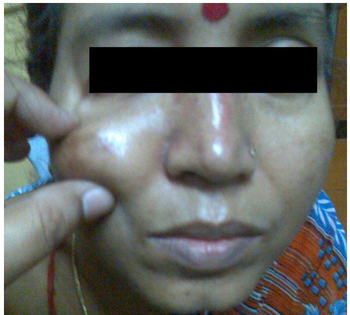
[Table/Fig-2]: Thick patch of skin below her right eye

past illness. She was married and was living with her husband and two sons. She had no history of abortions.