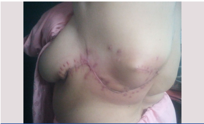
[Table/Fig-3]: Post-operative photograph at 4 months of follow up