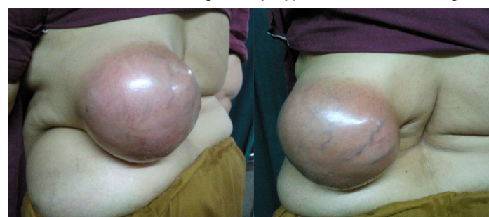
[Table/Fig-1]: Pre-operative photograph of the patient

A 45-year-old lady presented with the complaints of a slow growing painless swelling on her left side of back of 1 year duration. The swelling started with an innocuous looking small subcutaneous nodule which was initially ignored by the patient as a harmless lump. The lump progressively enlarged in size to attain the present dimensions [Table/Fig-1]. The patient denied any history of anorexia, weight loss, weakness in the left upper limb or limited mobility of left shoulder joint. She reported inability to lie supine due to sheer size of the lump. Local examination revealed a 13×12 cm spherical swelling on the left lower para-spinal region. The overlying skin was reddened and stretched with coursing prominent superficial veins. The lump was non tender, of variegated consistency, having well defined margins, and freely mobile over the underlying Lattismus dorsi muscle. The chest X-ray of the patient was unremarkable. Magnetic resonance imaging (MRI) lumbosacral spine revealed a 13×12 cm mass having solid and cystic components with internal septations in the subcutaneous tissue of left posterior para-spinal area. The mass was heterogeneously hyperintense on T2 weighted