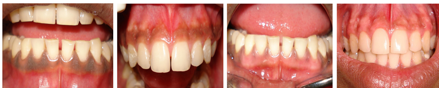
[Table/Fig-5A]: Patient with pigmentation in the mandibular anterior region