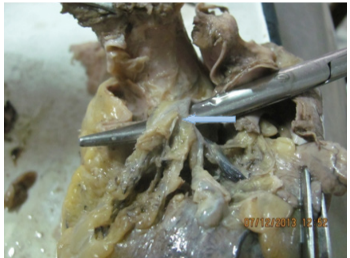
[Table/Fig-4b]: Tetrafurcation of LMCA