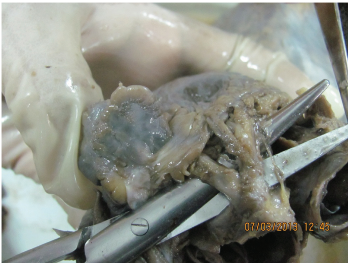
[Table/Fig-2]: Short length of left main coronary artery