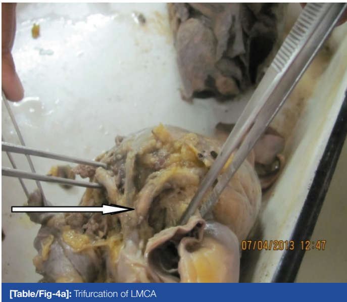
[Table/Fig-4a]: Trifurcation of LMCA