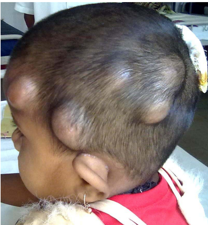
[Table/Fig-1]: Multiple nodular masses on the scalp

JHF is a rare hereditary disorder with variable penetrance. The disease is characterized by multiple tumourous muco-cutaneous proliferations, joint contractures, gingival hypertrophy and osteolytic lesions. Occasional patients have perianal papillomatous lesions. It is hypothesized that JHF is a connective tissue disorder with a progressive nature. This crippling disorder requires repeated surgical interventions and physiotherapy. Rehabilitation and counseling of parents play an essential role in treatment of these patients [1-4].