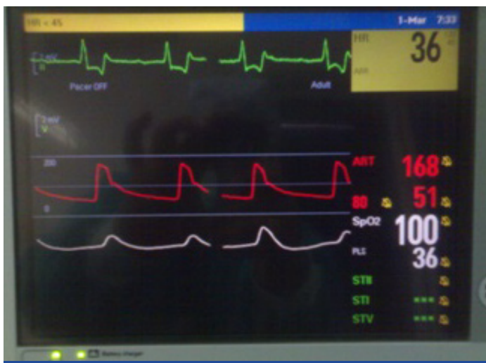
[Table/Fig-2]: Snapshot of intraoperative monitoring