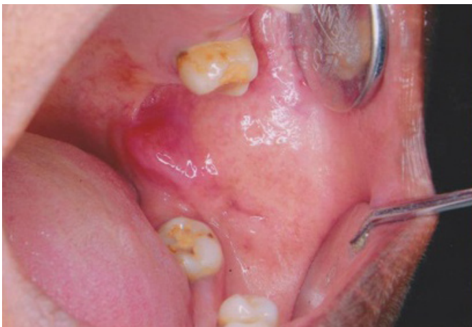
[Table/Fig-1]: Clinical picture depicting a mass of the buccal mucosa