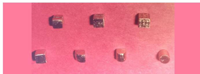
[Table/Fig-1]: seven test forms in metal with shape and surface alterations

In this study, oral stereognosis was tested with the aid of small metallic pellets referred to as test-forms. The test-forms were cast