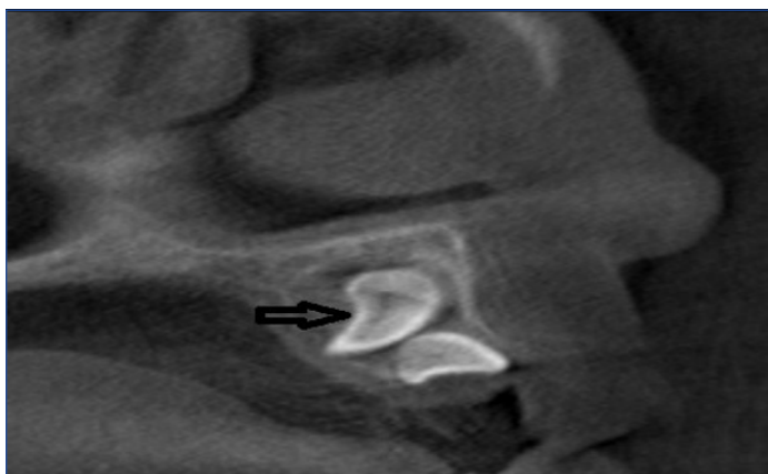
[Table/Fig-6]: Cross-sectional CT view demonstrates tooth 12 blocking the eruption of tooth 11 (Black arrow)

conventional radiographs. New imaging modalities such as CBCT result in better diagnosis and more efficient management of the complex malformations. Hence, advanced imaging techniques are an essential requirement, to arrive at the correct diagnosis and for choosing optimal treatment plan, as well as to monitor and document the treatment progress and final outcome [4].