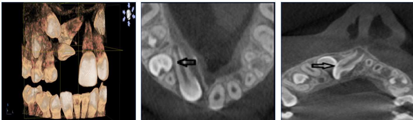
[Table/Fig-4]: 3D reconstructed image demonstrates inverted tooth 11 and its relationship with tooth 12. [Table/Fig-5a]: Transaxial CT view in the right maxillary region shows external root resorption in tooth 12 (Black arrow) [Table/Fig-5b]: Sequential Transaxial CT view reveals dilaceration in tooth 11 and close relationship with tooth 12 (Black arrow)