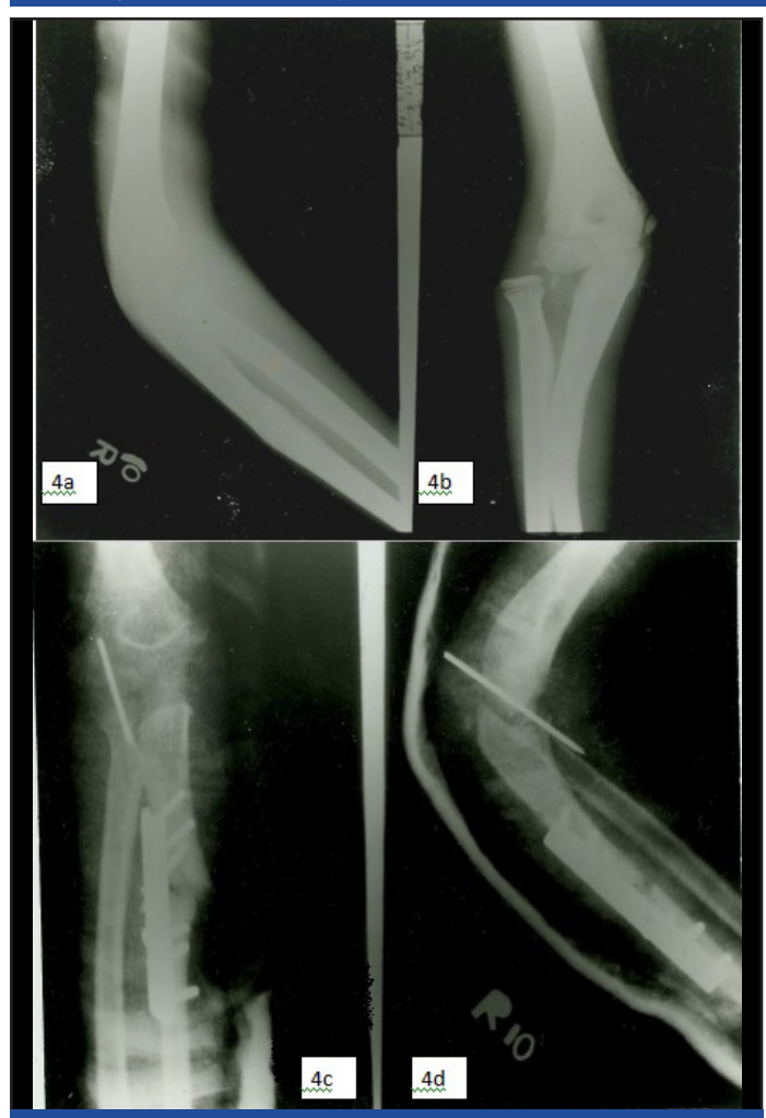
[Table/Fig-4]: (4a,b) Preop AP and lateral view skiagrams showing Bado type III Monteggia fracture dislocation (4c,d) Postop AP and lateral view skiagrams showing Hirayama corrective osteotomy fixed with DCP, wedge bonegraft & radiocapitellar K wire in the same case