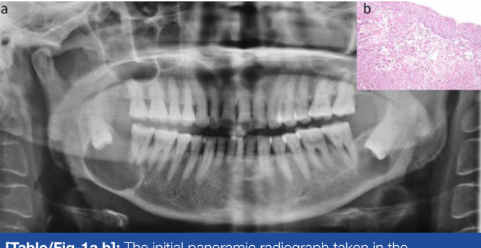
[Table/Fig-1a,b]: The initial panoramic radiograph taken in the local hospital. First biopsy after curettage of bilateral. (haematoxylin-eosin stain ×20)

Two months after the curettage, the patient was referred to Peking University School and Hospital of Stomatology, after she complained