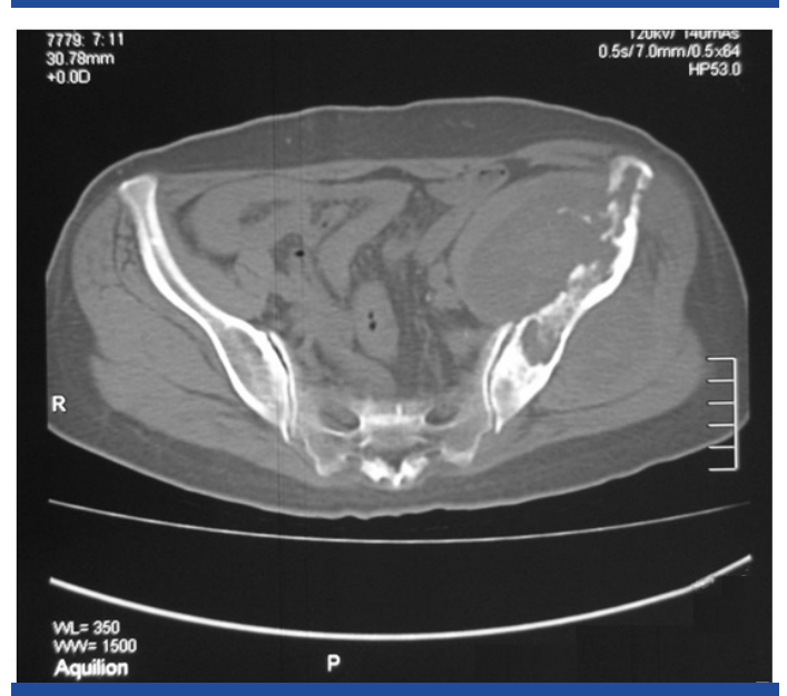
[Table/Fig-3]: Overall PET/CT examination after the second biopsy showed an invasive mass in the left pelvis