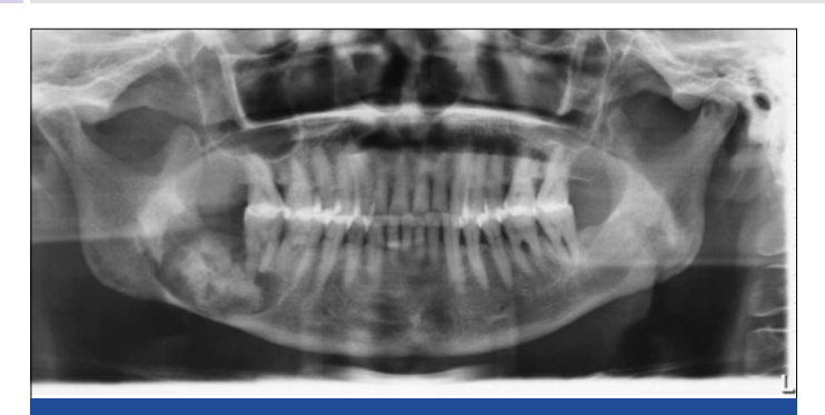
[Table/Fig-2]: The second panoramic radiograph taken two months after the curettage