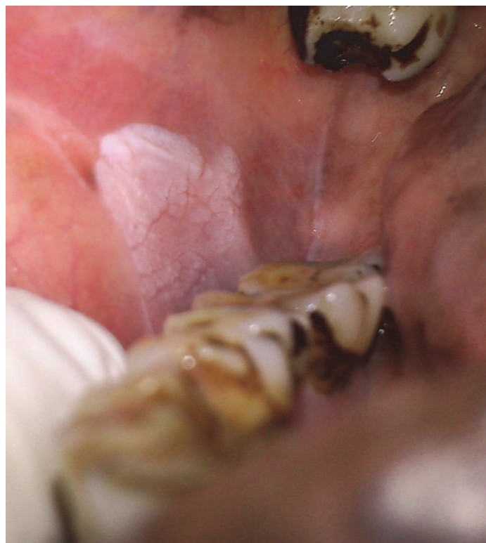
[Table/Fig-1]: White lesion in the buccal mucosa suggestive of homogeneous leukoplakia

agreement in verrucous leukoplakia was 53.33% and percentage of underdiagnosis was 46.67% [Table/Fig-4].