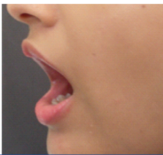
[Table/Fig-7]: Face lift exercise [Table/Fig-8]: Lip exercise with mouth slightly open