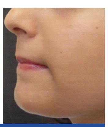
[Table/Fig-9]: Lip exercise with lower lip forward to contact the upper lip [Table/Fig-10]: Inversion of upper and lower lip

and observe that the relaxed lower part of the orbicularis oris follows the retraction and elevation of the corners of the mouth to cover the mandibular teeth. Keep this position for 10s [Table/Fig-3].