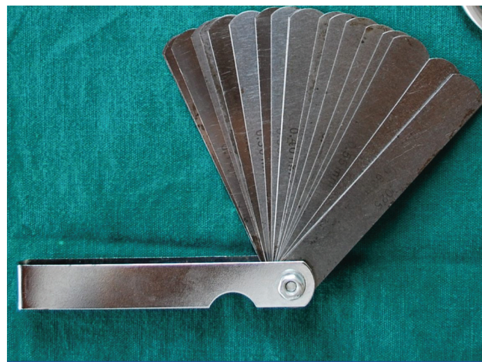
[Table/Fig-2]: Leaf gauge used to measure the separation effect