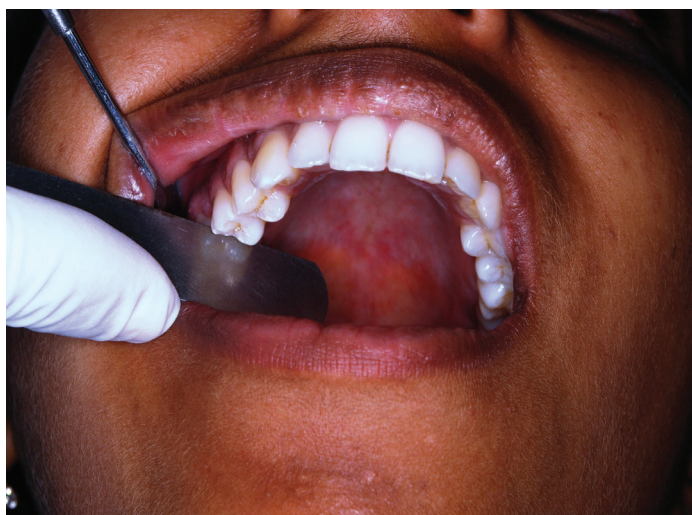
[Table/Fig-3]: Measuring the amount of separation with the help of leaf gauge