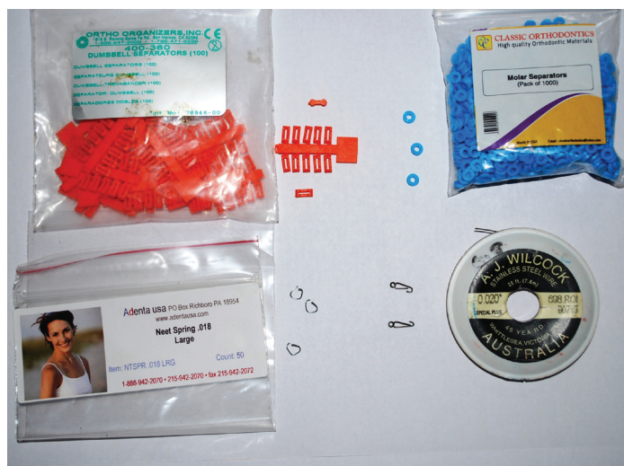
[Table/Fig-1]: Types of separators used in the study.

A gradual reduction of contact point tightness often permits separator loss before the banding appointment. This can occur